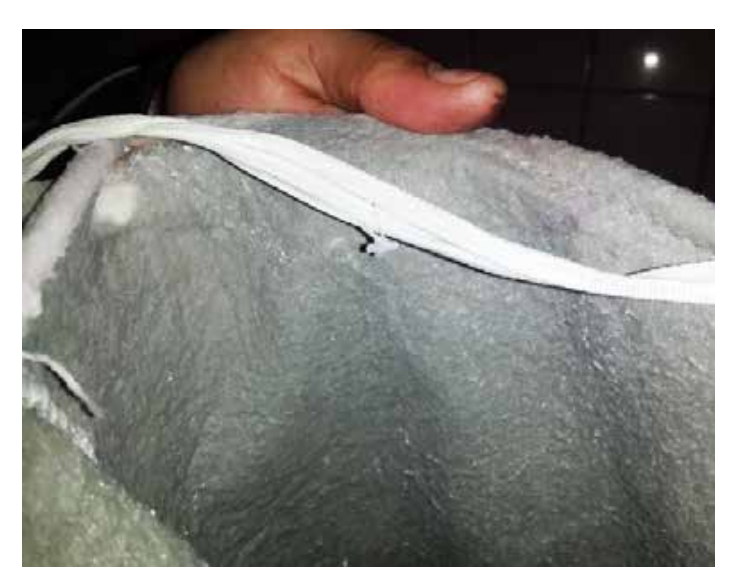
48 hours after Vulcan was installed, the filter still stays clean.