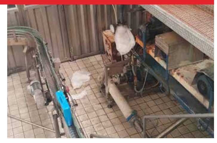
The Coca-Cola factory in Marrakech, Morocco