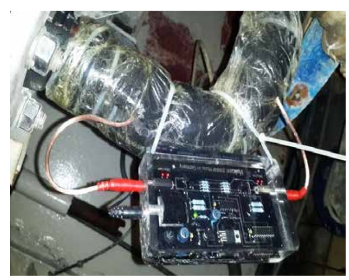
Vulcan 5000 was installed on the water inlet of the water recycling room.